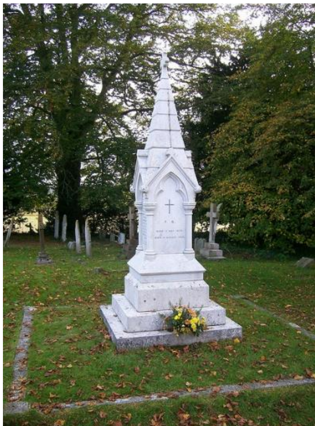
Florence Nightingale’s Headstone in St. Margaret of Antioch Churchyard, East Wellow