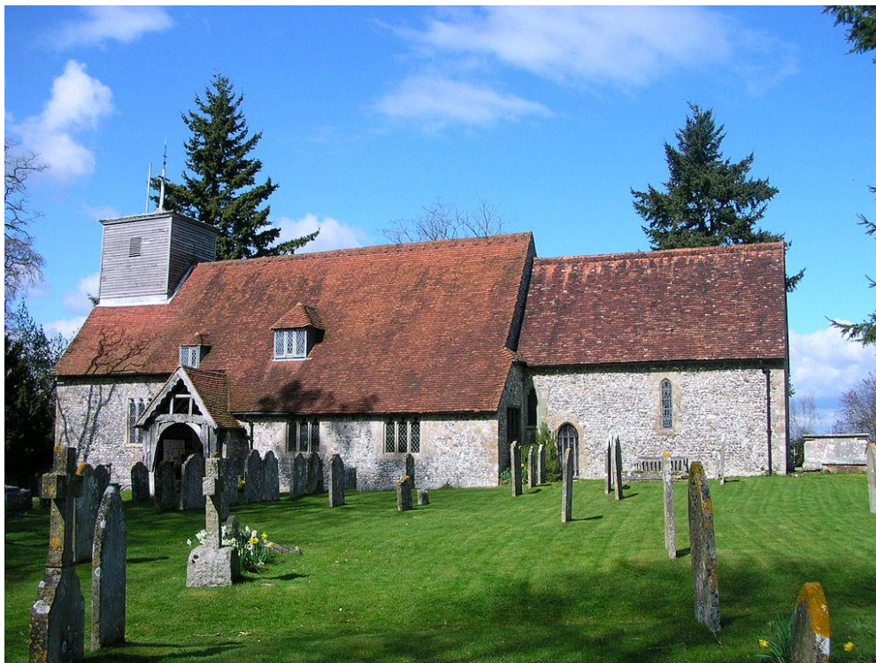
St. Margaret of Antioch Churchyard, East Wellow

There are no Commonwealth War Graves Commission Headstones located in the churchyard, however a notable burial is located there – Florence Nightingale, who died in 1910, and well known as “The Lady with the Lamp” for her contributions resulting in creation of a highly regarded and respected nursing profession.